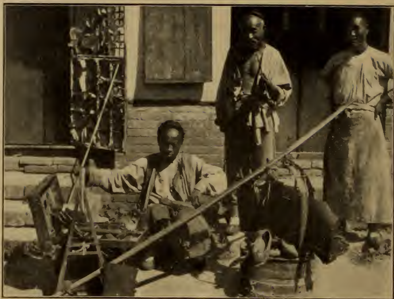
THE VILLAGE COBBLER.